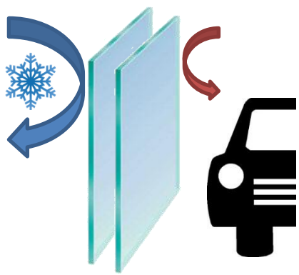
CoolLock ThermaPro Low-E

The CoolLock insulated Low-E option is perfect if locking out the cold is your goal. The energy-efficient, fade-protection Low-E surface coating ensures that your garage maintains its temperature by keeping radiant heat in.