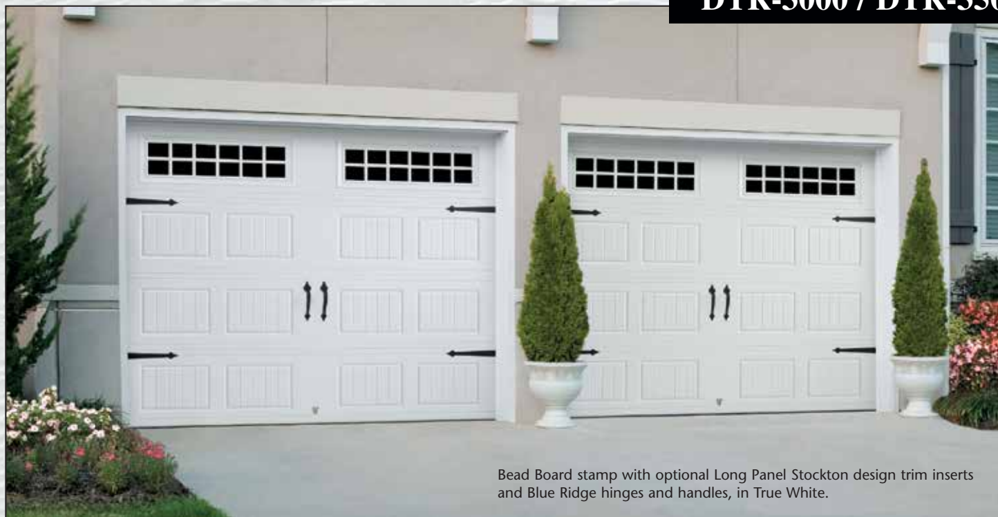
Bead Board stamp with optional Long Panel Stockton design trim inserts and Blue Ridge hinges and handles, in True White.