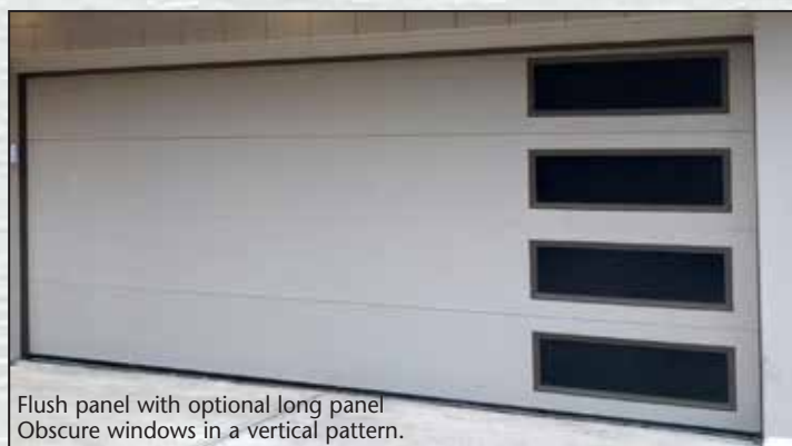
Flush panel with optional long panel Obscure windows in a vertical pattern.