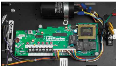
Includes the Medium-Duty Logic Board with Built-In Receiver